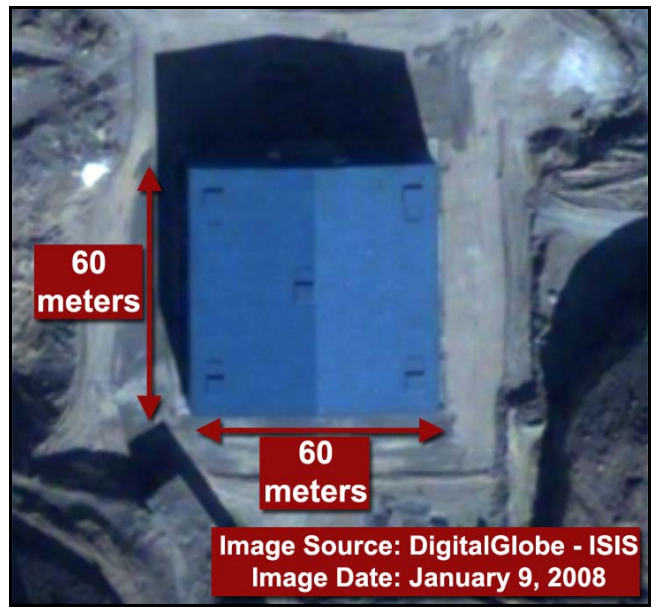
Figure 9. January 9, 2008 image of new structure at the suspect Syrian site. The new structure is approximately 13 meters wider than the original structure on each side.