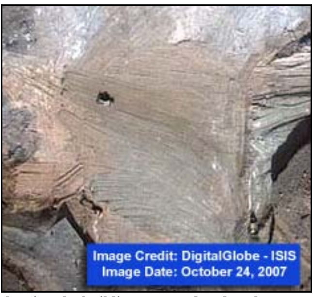
Figure 8. October 24, 2007 image showing the building removed and perhaps partially buried after the September 6 Israeli raid.