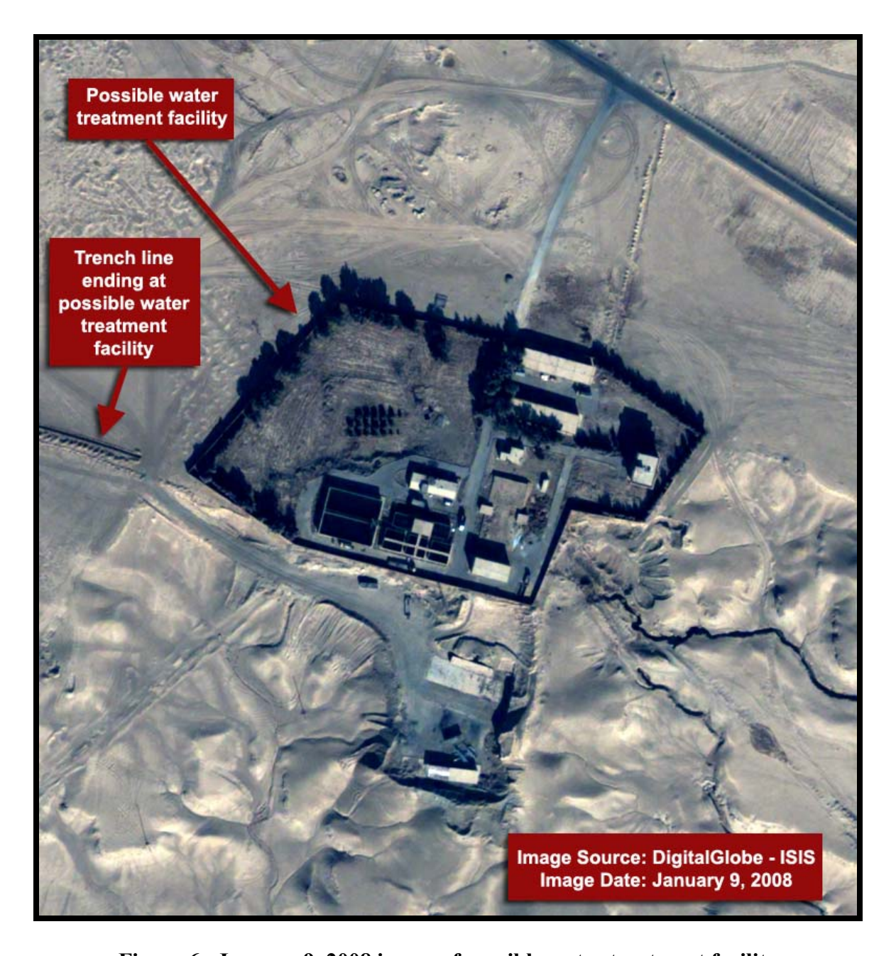
Figure 6. January 9, 2008 image of possible water treatment facility