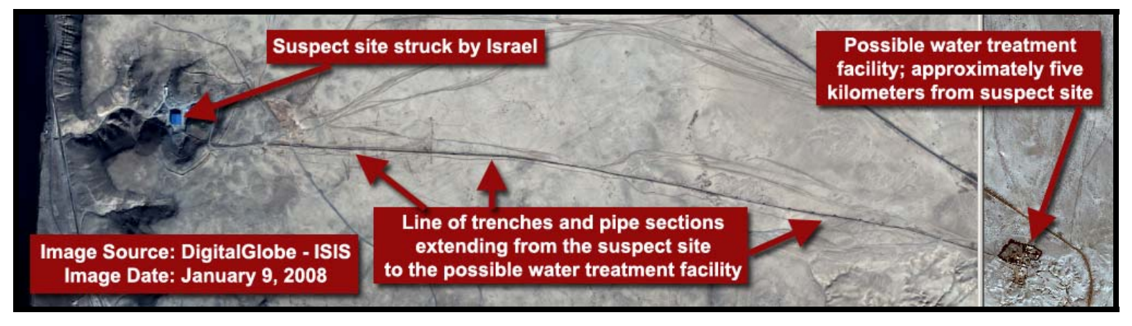
Figure 3. January 9, 2008 wide image of suspect site and possible water treatment facility.