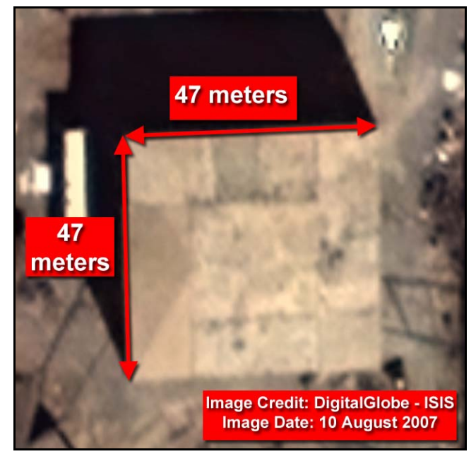
Figure 7. August 10, 2007 image of the suspect reactor building.