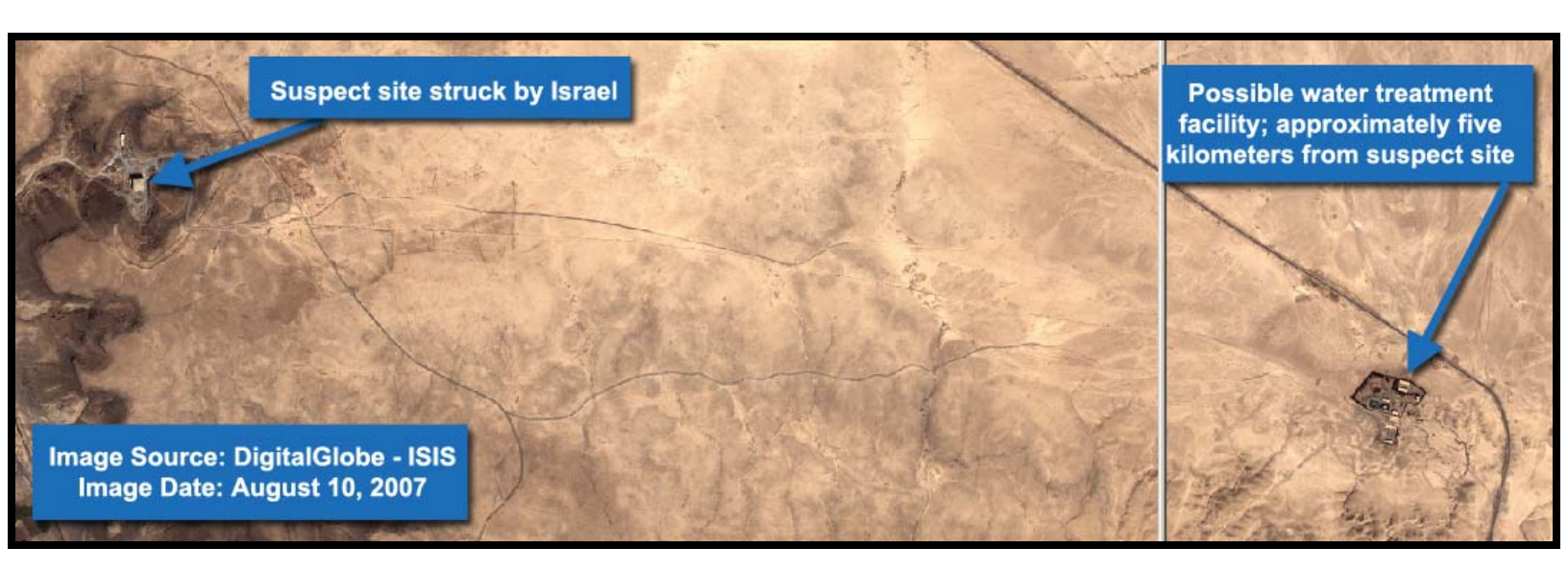
Figure 2. August 10, 2007 wide image of suspect site and possible water treatment facility.

IAEA Director General Mohamed ElBaradei has sought permission from Syria to inspect the site, but so far Syria has denied the IAEA access. If Syria allows the IAEA to inspect the site, the inspectors will have a more difficult time looking for evidence of reactor construction, because the new building covers whatever was left of the original building.