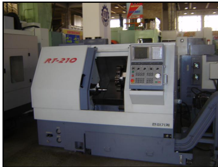
Figure 7: A Ryonha computer-numerically-controlled turning center. Photo taken at the Heavy Industry Hall of the Three Revolutions Exhibition

It is not surprising that North Korea would seek to both acquire and make computer-numerically-controlled (CNC) machine tools. Foreign made machine tools would be more reliable and capable, being equipped with more modern features than North Korean ones. Besides performing more capably, these imported machines could be reverse engineered in an attempt to improve North Korea’s own domestically produced machine tools.