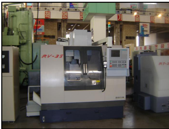
Figure 6: A Ryonha vertical machining center. Photo taken in the Heavy Industry Hall at the Three Revolutions Exhibition.

In addition to importing high precision, computer controlled equipment to make centrifuge components, North Korea makes its own computer-controlled machine tools that could be part of a centrifuge manufacturing complex. It is known to have three major manufacturing companies that make machine tools for domestic use and foreign export, Ryonha Machinery Joint Venture Corporation in Pyongyang, the Kusong Machine-Tool Plant in North Pyongan Province, and the Huichon Machine Tool Factory in Huichon city. North Korean media announced in recent years that the Kusong Machine Tool Plant had recently undergone modernization. 71 Figures 6 and 7 show Ryonha machine tools on display at the Three Revolutions Exhibition, a technological museum in Pyongyang. U.S. officials assessed that some of the North Korean machine tools are capable of making high precision centrifuge components. They are able to achieve a level of precision similar to machine tools that Iraq acquired in the late 1980s for its centrifuge manufacturing complex. 72 The reliability of these domestically produced machines is unknown.