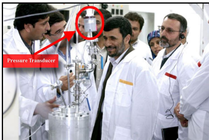
Figure 5: President Ahmadinejad during his tour of the Natanz complex in 2008. In the center of the image is a pressure transducer. Iran has recently sought large numbers of pressure transducers overseas suspected for its gas centrifuge uranium enrichment program. North Korea reportedly also acquired them.

After 2007, NCG secretly procured goods that were very likely intended for a uranium enrichment program. 66 In the late 2000s, Western intelligence agencies detected North Korean procurements that appeared to be for the manufacture of centrifuges. From 2007 to 2009, North Korea entities obtained state-of-the-art computer numerically controlled (CNC) machines via China needed to make centrifuge parts, according to a European intelligence official. (During this period, North Korea was seeking sophisticated equipment for missile, nuclear, and conventional military uses, such as radar and unmanned aerial vehicles). North Korea purchased spare parts for centrifuge-related equipment and bought more specialized epoxy for use in assembling centrifuges.