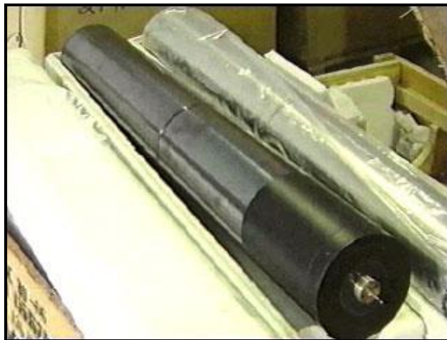
Figure 4: A P2 centrifuge rotor assembly, showing a bellows in the middle of the tube and the pin of the bottom bearing, provided to Libya by the Khan network and subsequently sent to the United States. North Korea likely received several such assemblies and may now be producing them.

training of North Koreans in operating specialized machine tools.