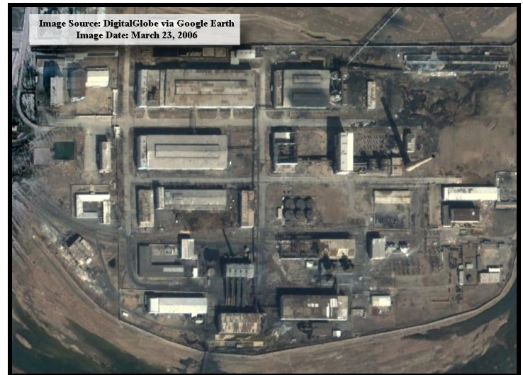
Figure 9. DigitalGlobe satellite image from March 23, 2006 on Google Earth showing an industrial plant in Pyongsan city (38.317602, 126.433151). Based on the location of buildings and stacks, ISIS assesses that this is the same site seen in the IAEA video.

Although intelligence agencies likely know more about suspected centrifuge plants in North Korea, ISIS has found little of substance about where North Korea pursues its centrifuge development. Even which organization is responsible for the centrifuge program—the atomic energy establishment or the military aerospace industry—remains unknown. Determining answers to these and other questions about North Korea's centrifuge program is critical.