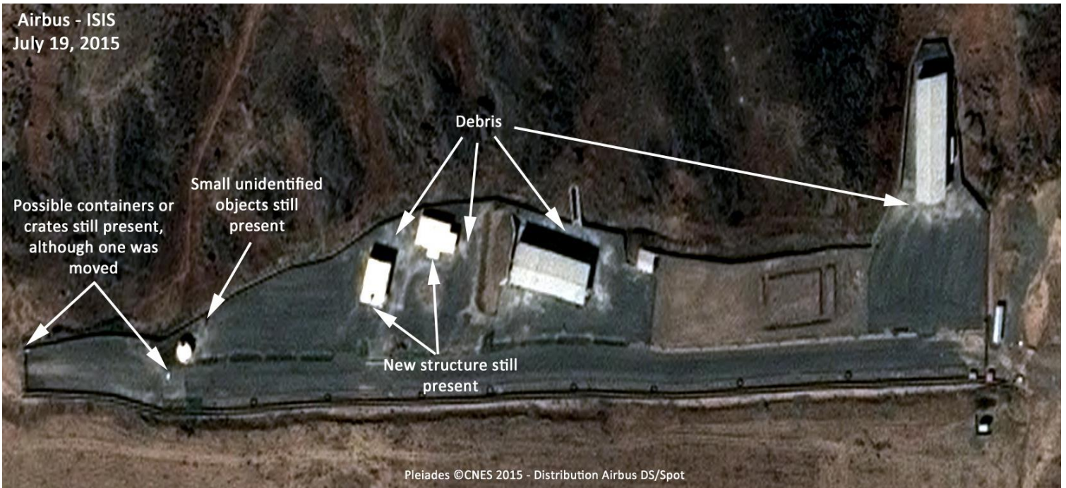
Figure 2. July 19, 2015 Airbus imagery showing the status of the site at the Parchin military Complex that has been linked to high explosive work related to the development of nuclear weapons.